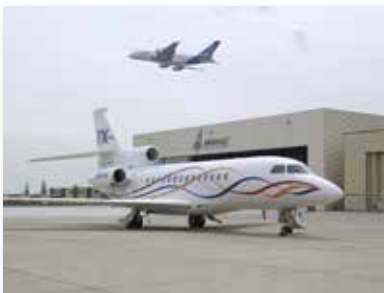
Falcon X (Dassault Aviation) et Airbus A380

http://www.ensma.fr/en/admission/other-degrees/