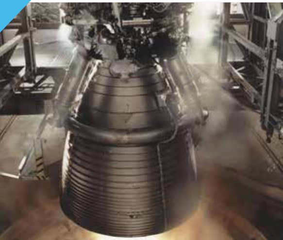
Vulcain 2 - Safran Group