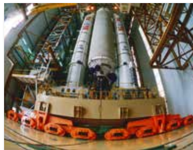
Ariane 5 rocket (ESA/CNES/Arianespace/CEP)